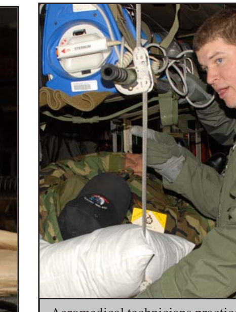
Aeromedical technicians practice on Airmen who are simulated patients onboard a C-130 during the skills challenge.