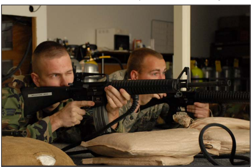
Airmen hone their war-fighting skills by firing an M-16 rifle on a virtual firing range during the skills challenge.