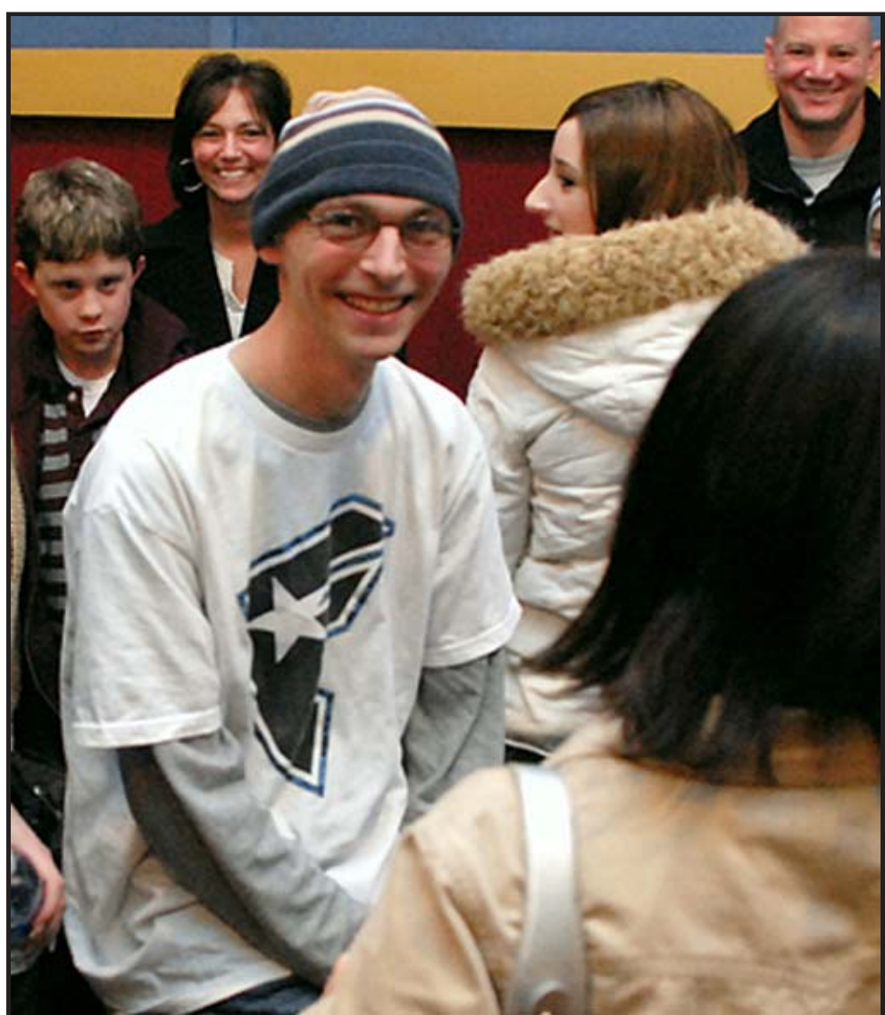
Blood thicker than water: Airman with leukemia finds family roots among fellow Airmen.