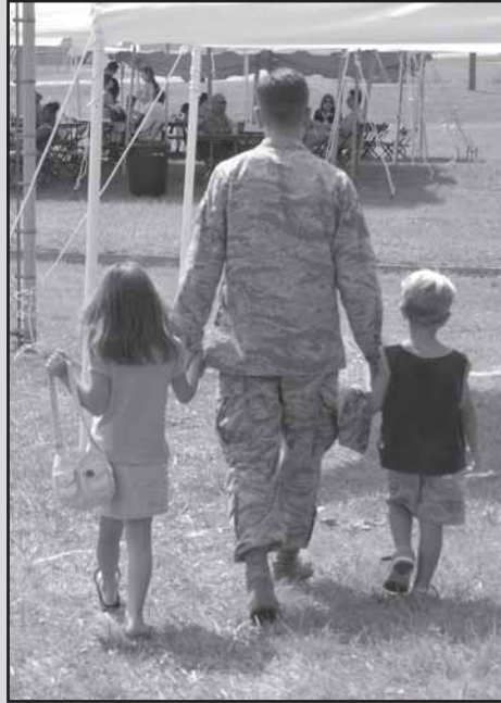
Left: A Reservist's family member enjoys the cool water in a blow up water slide during the 914ths "Family Day" event. Niagara's Reservists were encouraged to bring their Families on base for food, games and fun during part of the Unit Training Assembly last month. Right: A 914th member and his family take a break from the UTA and walk down to the area where food and beverages were served during the event.