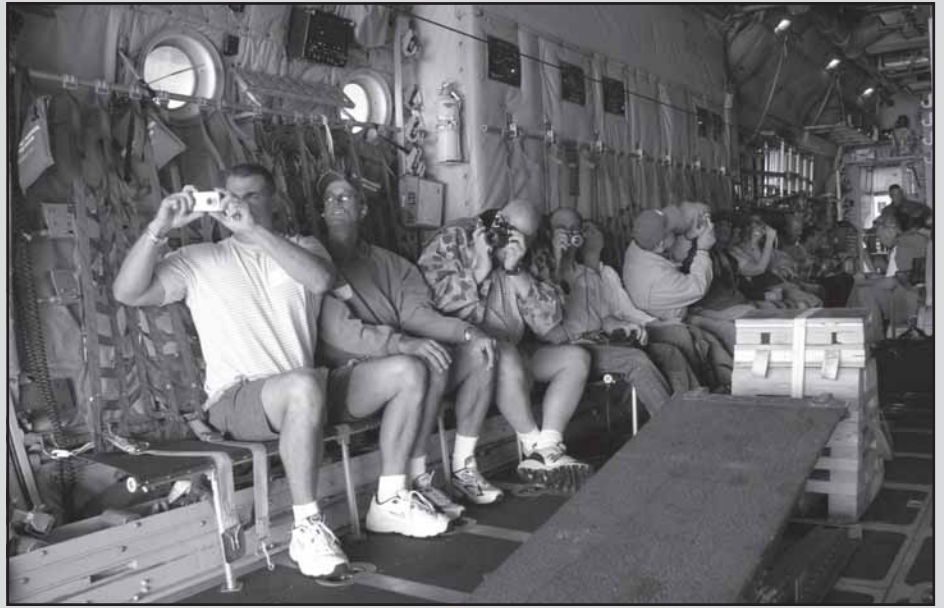
Left: 914th and 107th Airlift Wings members' employers explore the back of a C-130 before take off. Above: Employers enjoy a birds eye view of Western New York from a C-130 as it flies over some of the regions most famous landmarks such as Niagara Falls, the Niagara River, the city of Buffalo and Ralph Wilson Stadium (home of the Buffalo Bills) during the Wing's "Bosses Day"